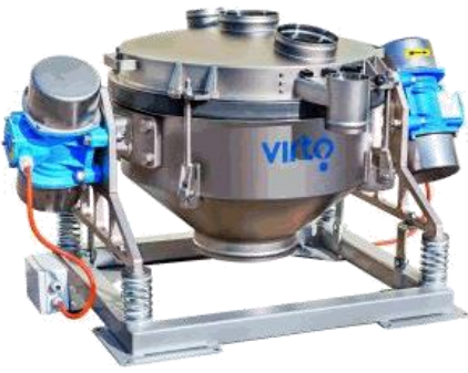
MULTI - FREQUENCY SIEVES