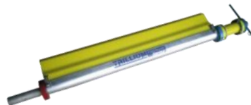
PRIMARY AND V-Plow BELT CLEANERS