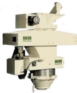
DUST FREE LOADING SPOUTS